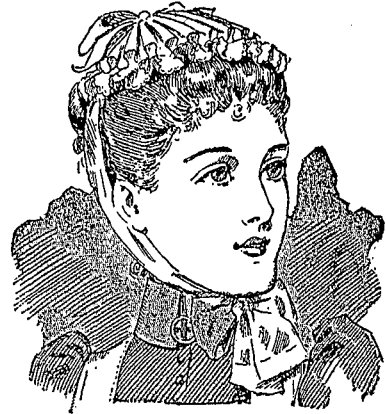
Garrould's New " Sister Mabel " Cap (as per sketch). Made of fluted washing cambric with French frill edging, 1/6 each, by post 1/9.]

Telegraphic Address: "GARROULD, LONDON."